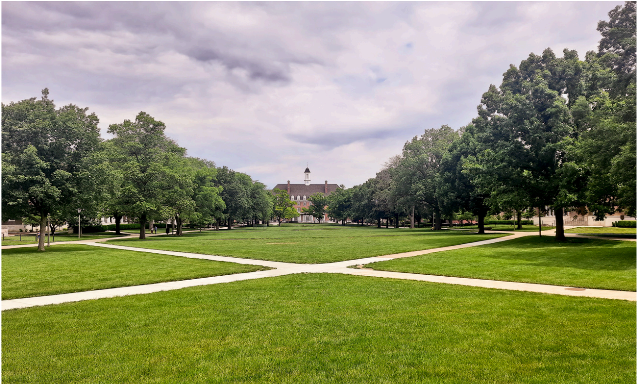
University of Illinois Urbana Champaign Quad